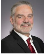
Senator Cal Bahr 90%