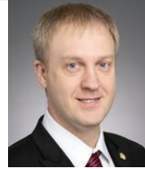
Senator Justin Eichorn 90%