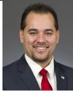
Senator Eric Lucero 97%