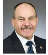
Senator Jeff Howe 90%