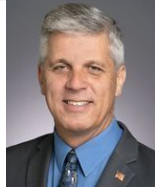
Senator Steve Drazkowski 94%